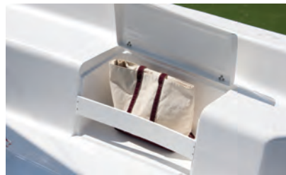
Convenient Cockpit Seat Storage